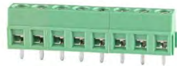
(Series Image-Reference Only)

— X X X Contact plating 6: Tin Housing color G:Green No.of contacts 2-24