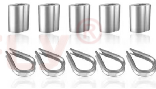
Applicable terminals: 8-shaped, elliptical aluminum sleeve

Kit Type 1: Type 1 Plastic color L: Blue