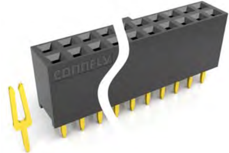
(Series Image-Reference Only)